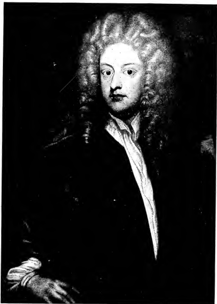
JOSEPH ADDISON 1672—1719

From the painting by Sir Godfrey Kneller—No. 283. National Portrait Gallery, London